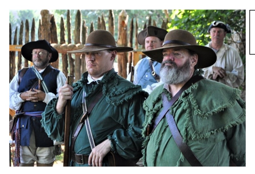
What better way to spend Independence Day than with our SAR family!