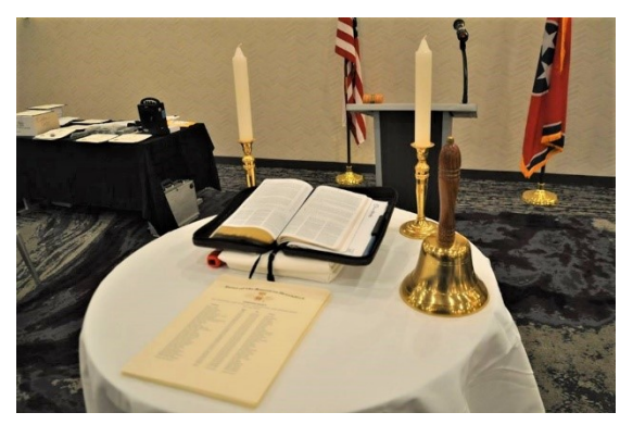
Memorial Table for Compatriots who passed away in 2019

the reading of James 4:13-15. Chaplain Finch spoke of the brevity of life and the reality of death. The title of the sermon was "The Vanishing Vapor." He urged compatriots to not follow the urging of the world to grab what you can, but rather store up treasures in heaven. After the reading of each name with the ringing of a bell in memory, a moment of silence was observed, followed by a closing prayer.