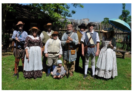
Watauga Chapter members at the Independence Day Celebration at James White Fort