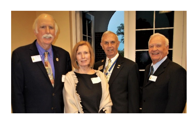
We Are SAR