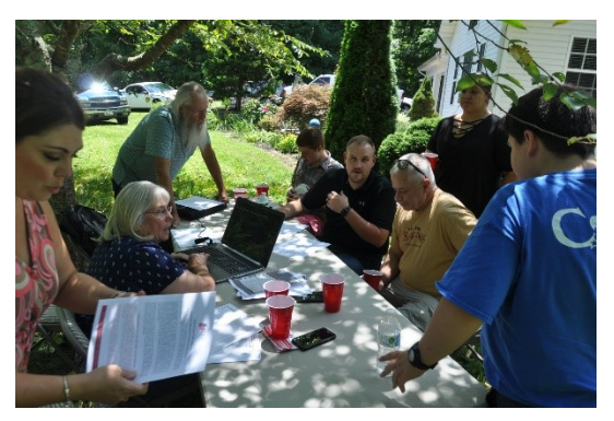
Much activity under the "Genealogy Tree" with applications being completed.