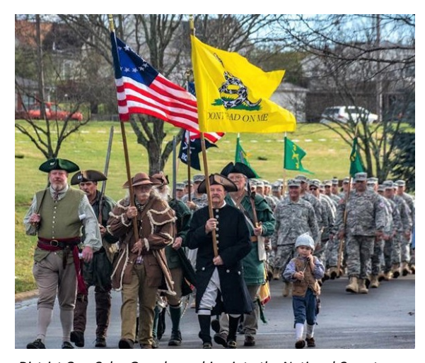
District One Color Guard marching into the National Cemetery for the WAA Ceremony.