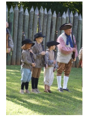
CAR marching with Color Guard