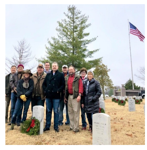
Isaac Shelby Chapter placing wreaths at WAA last year.

Wreaths Across America has been cancelled in most National Cemeteries now, but some locations will allow "private" gatherings to place the wreaths on the veterans' graves without ceremony.