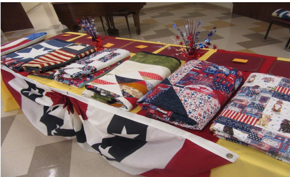
Quilts were awarded at the DAR Flag Day luncheon by the Quilts of Valor organization. The quilts are awarded to a Service Member or Veteran who has been touched by war.