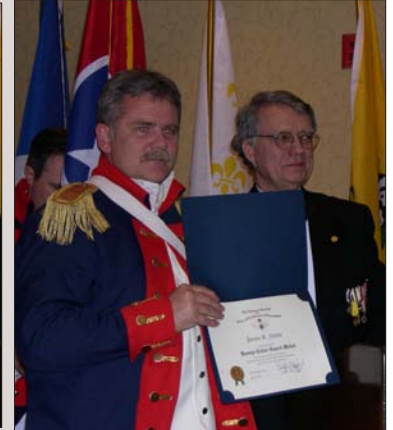
James K. Stone Bronze Color Guard Medal