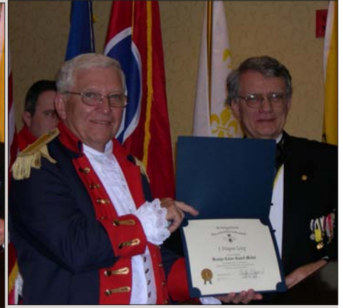
J. Wayne Long Bronze Color Guard Medal