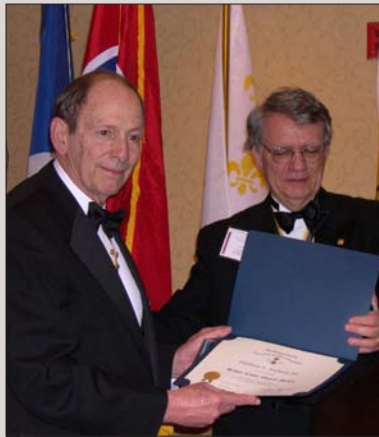
William L. Eubank Silver Color Guard Medal