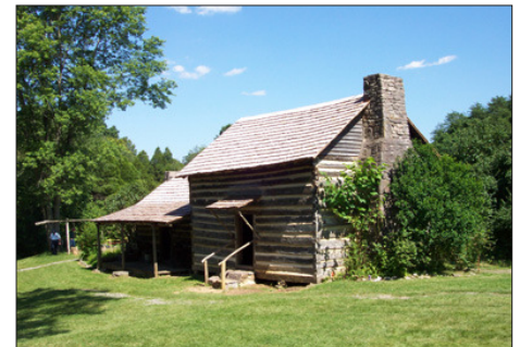
Marble Springs, Knoxville